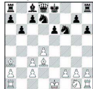
2.15.4. WHITE to move & mate in 1