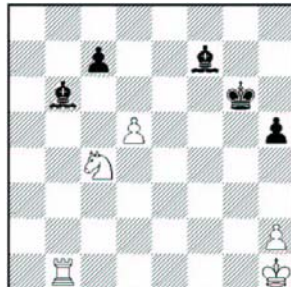
2.15.2. BLACK to move & mate in 1