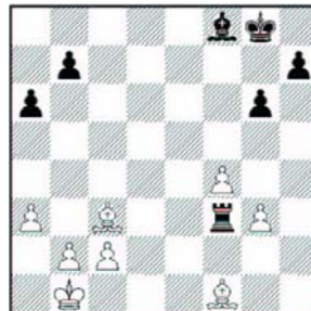
2.15.3. WHITE to move & mate in 1